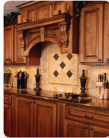
WOOD PRIDE Interior Wood Finishing Stain