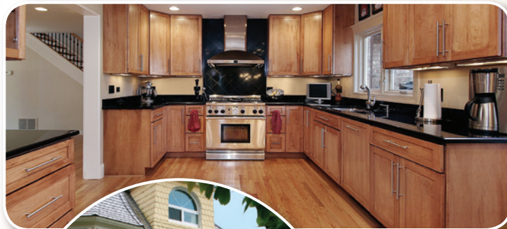
WOOD PRIDE Interior Wood Finishing Stain