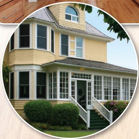
WOOD PRIDE Exterior Solid Color Siding Stain