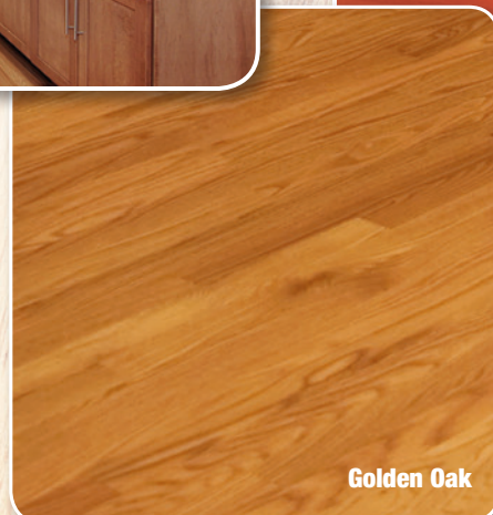
WOOD PRIDE Interior Semi-Transparent Stain