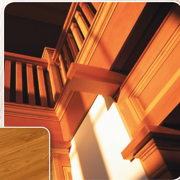
WOOD PRIDE Interior Crystal Clear Varnish